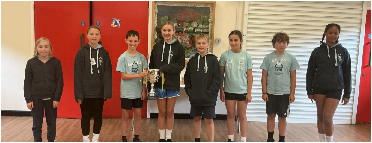
Capteiniaid Chwaraeon y Llysoedd 2025-26 / Our 2025-26 House Sports Captains

Llongyfarchiadau Llys Garw ar ennill Mabolgampau 2026!